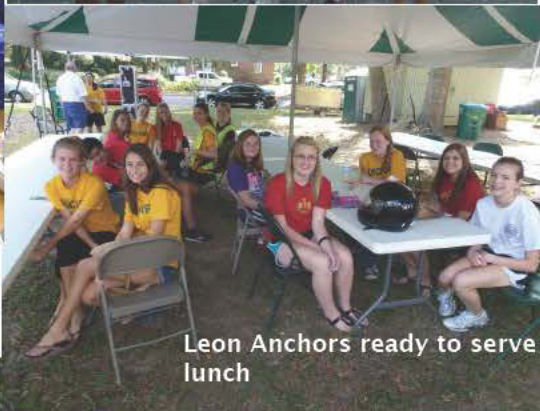
Leon Anchors ready to serve lunch