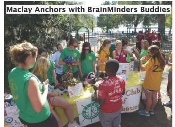
Maclay Anchors with BrainMinders Buddies